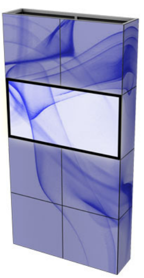
Any One Quad 23" w x 23" h