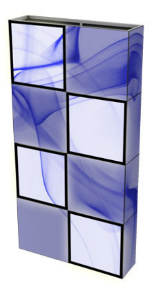
Any Combination of Individual Quads